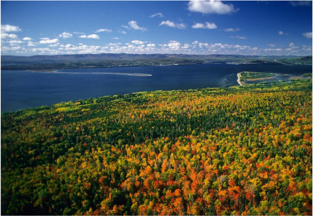
Forillon National Park