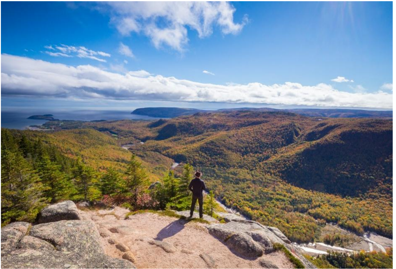
Cape Breton Highlands National Park TOURISM NOVA SCOTIA PARKS CANADA