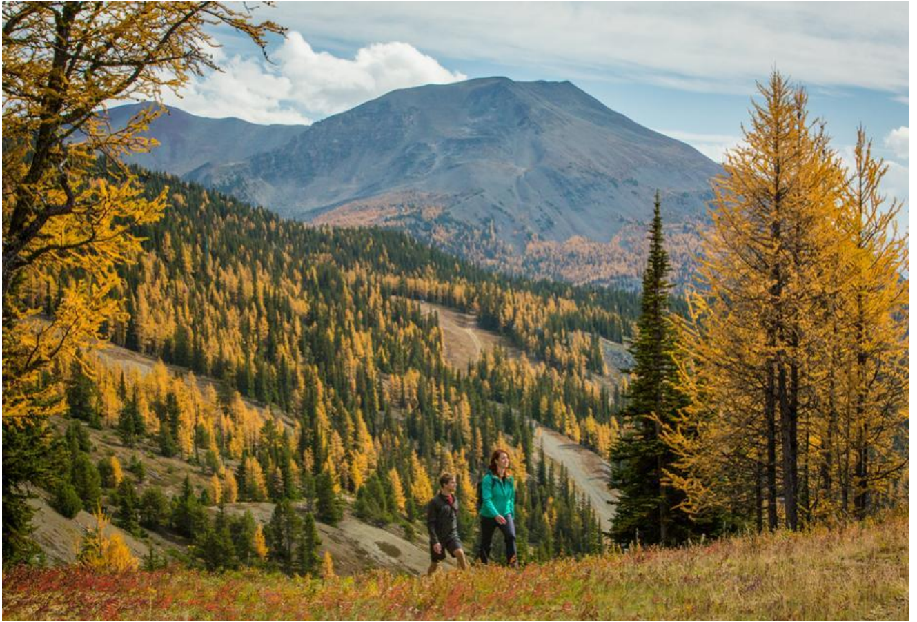
Banff National Park