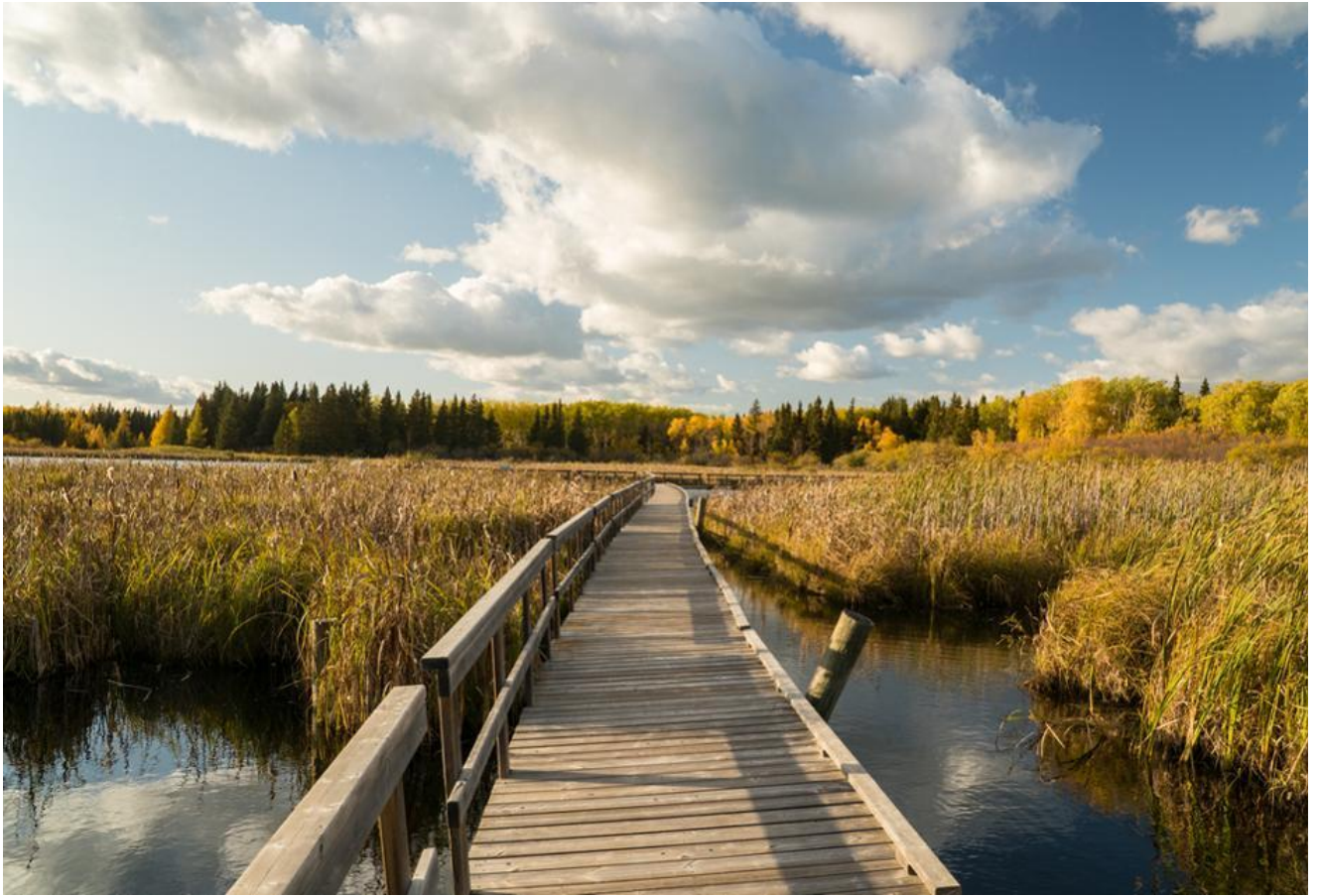
Riding Mountain National Park TRAVEL MANITOBA