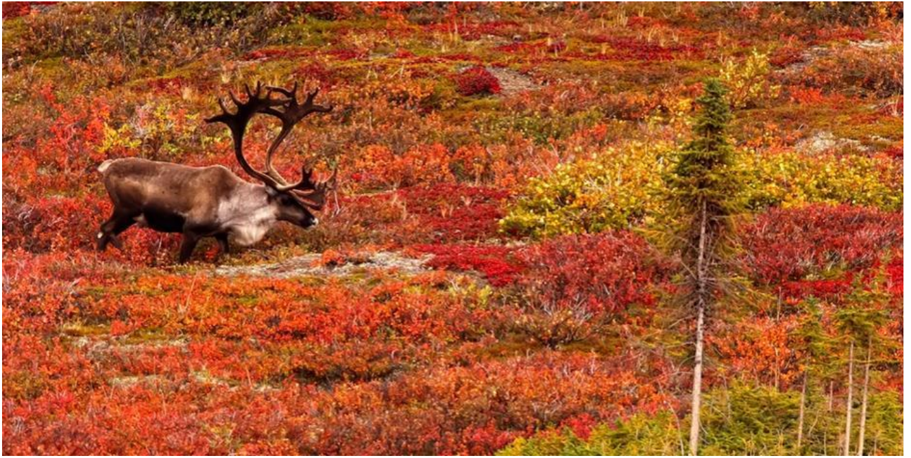
Tombstone Territorial Park