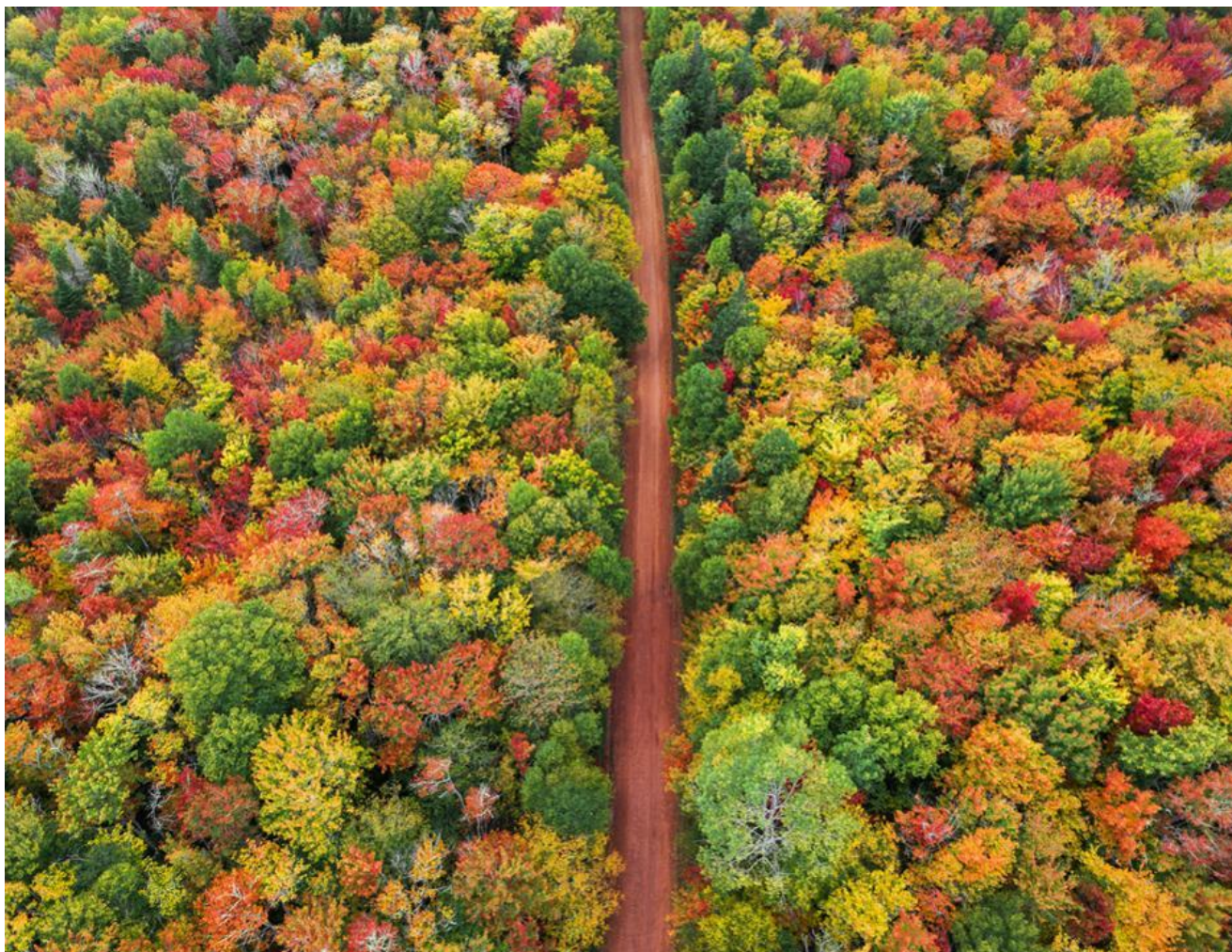
Confederation Trail

What is it about fall that makes people even more anxious to get out and experience the great outdoors? Thanks to its unparalleled geography, Canada boasts an amazing array of hiking trails that show-off autumn's cornucopia of colors. Here are some of Canada's best fall foliage hikes.