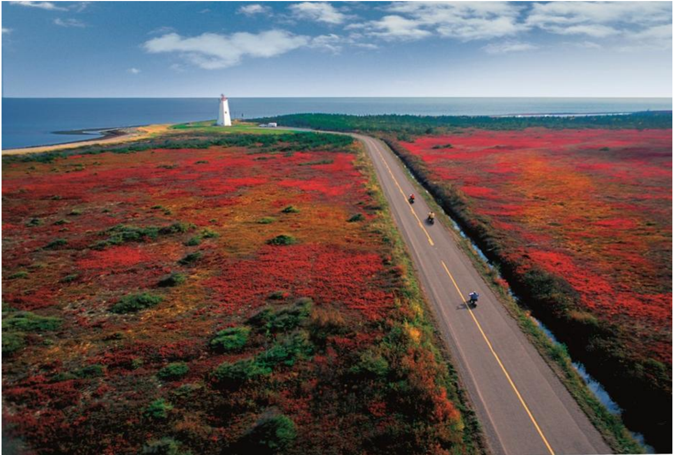
Miscou Island Peat Bog Trail NB TOURISM