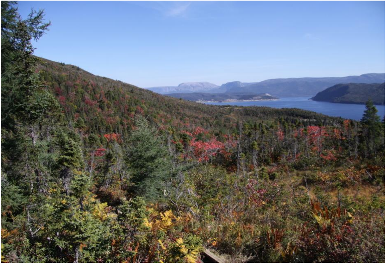
Lookout Hills Trail