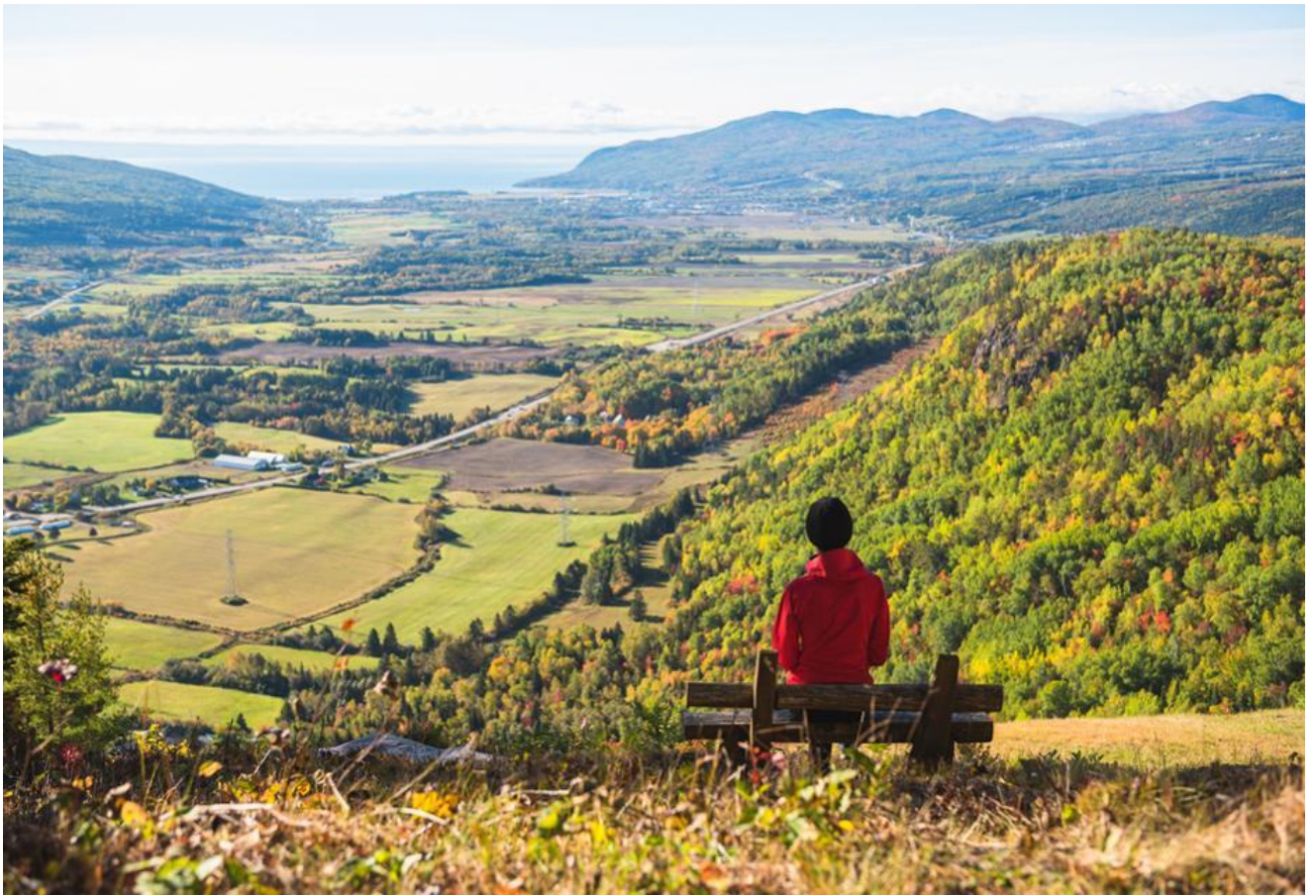
Les Florents TOURISME CHARLEVOIX, FRANCIS GAGNON