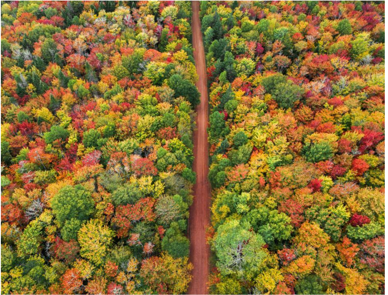
Confederation Trail TOURISM PEI SANDER MEURS