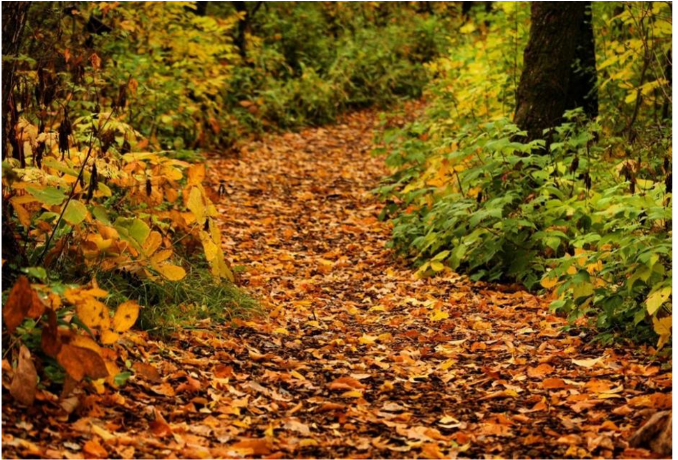
Pike Lake Provincial Park