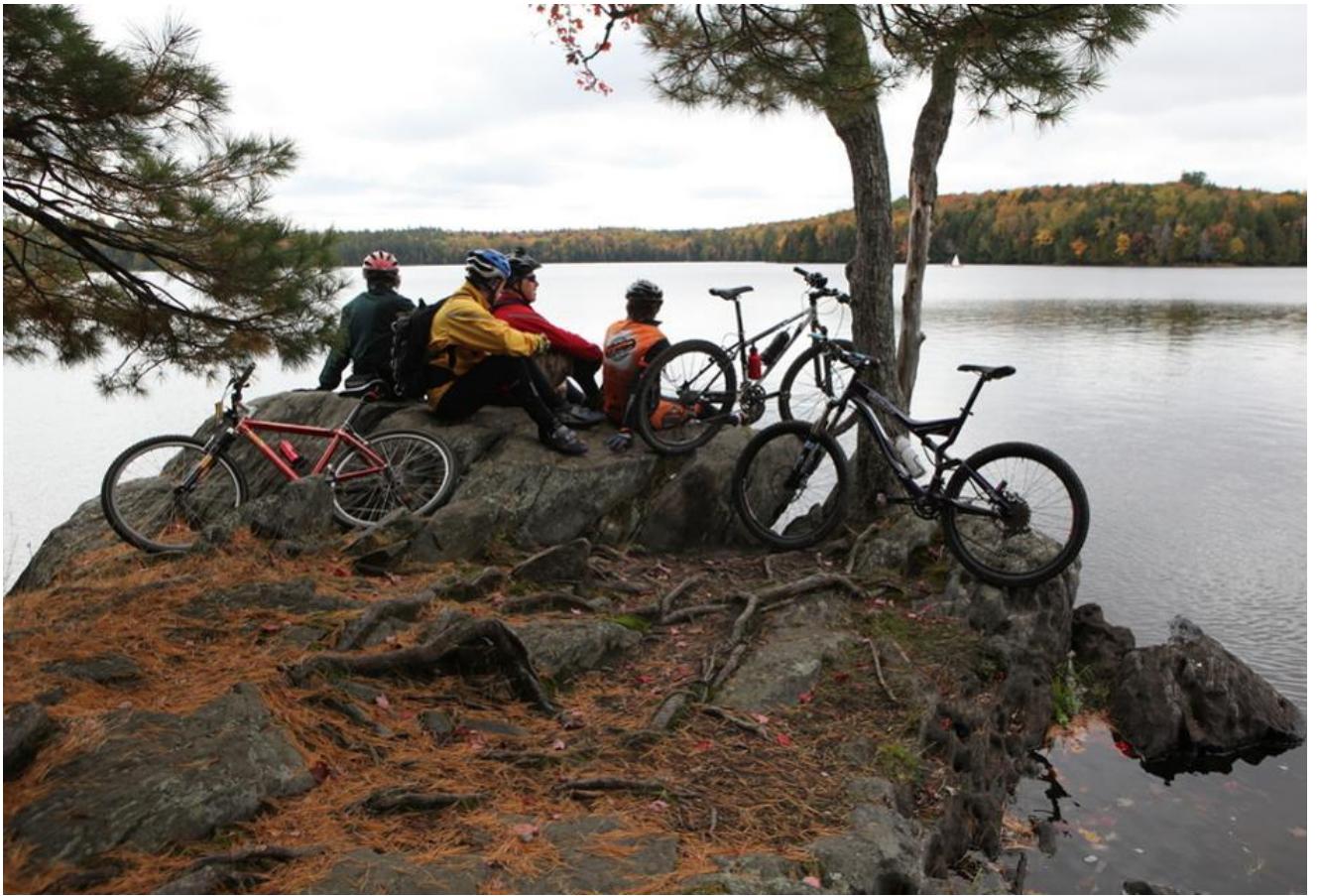
Silent Lake ONTARIO PARKS