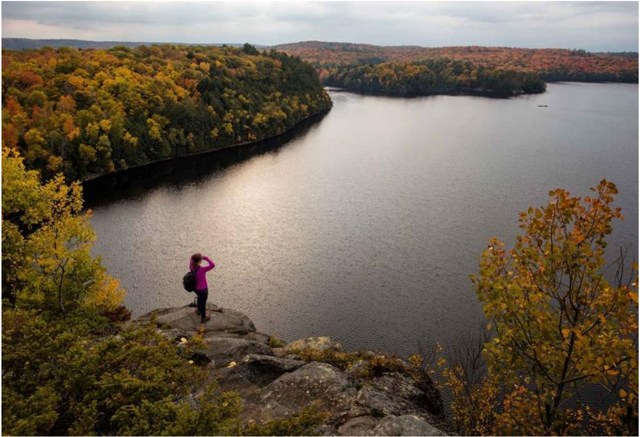
Restoule Provincial Park ONTARIO PARKS