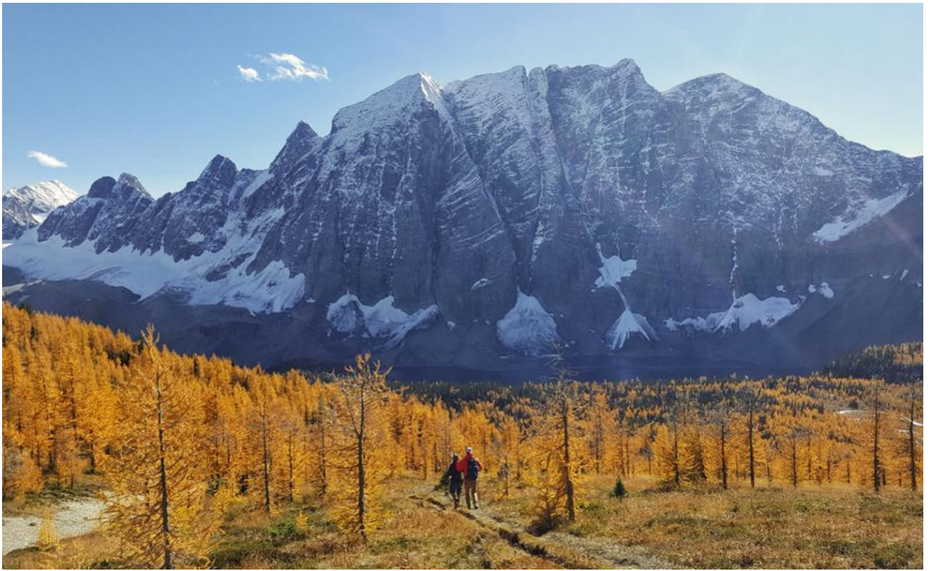
Kootenay National Park