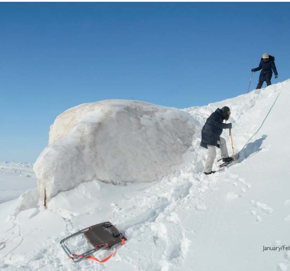
The red cliffs of Îles de la Madeleine. TOP Baby harp seal or “white coat.” OPPOSITE, TOP One of the signature bold hues of the houses that dot the islands. OPPOSITE, BOTTOM Locals clambering down snowy, icy cliffs to explore the frozen seascape...and set up lawn chairs to sunbathe.

F lying out of Gaspé, I see the eastern edge of Quebec marked by a long string of lights hugging the shoreline. Far below is opaque snow and then translucent ice, a marbled surface that only reveals its larger pattern at flying altitude. Ice blobs, almost-perfect circles, grow bigger and bigger the farther we fly offshore, and the glow of the plane glistens, illuminated in watery veins like phosphorescence. I spot a star, then another, another, and Orion’s Belt and then Orion himself looming large over this wintry hinterland.