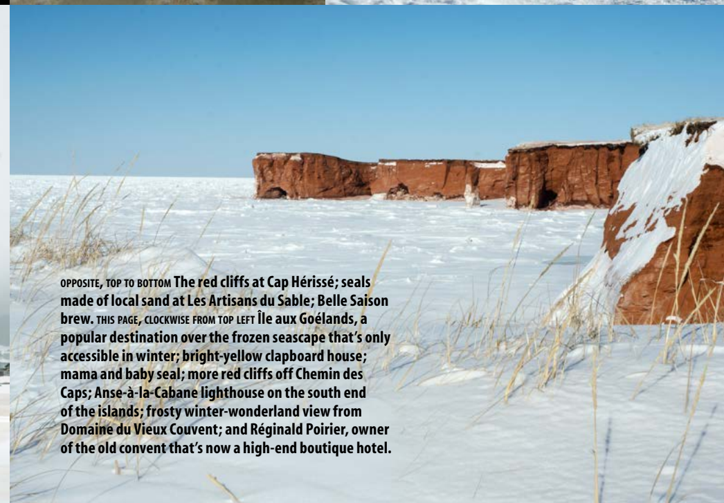
OPPOSITE, TOP TO BOTTOM The red cliffs at Cap Hérissé; seals made of local sand at Les Artisans du Sable; Belle Saison brew. THIS PAGE, CLOCKWISE FROM TOP LEFT Île aux Goélands, a popular destination over the frozen seascape that's only accessible in winter; bright-yellow clapboard house; mama and baby seal; more red cliffs off Chemin des Caps; Anse-à-la-Cabane lighthouse on the south end of the islands; frosty winter-wonderland view from Domaine du Vieux Couvent; and Réginald Poirier, owner of the old convent that's now a high-end boutique hotel.