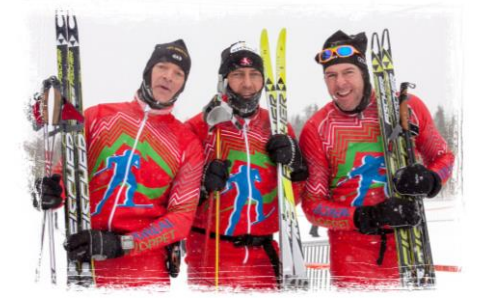
BORÉAL LOPPET FORESTVILLE, CÔTE-NORD | February 2017

The annual Boréal Loppet is the longest cross-country ski race held in Québec. The 2017 edition will take place in Forestville. Elite skiers race on a challenging 60-km (100-mi.) course. Less experienced skiers have the opportunity to race on a 27-km (17-mi.) course, while skiers of all ages can join in the fun by participating in the 7-km (4-mi.) and 14-km (9-mi.) races. Family activities are also offered on site and elsewhere in Forestville. www.borealloppet.ca