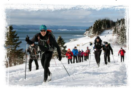
TDLG ON SKIS GASPÉ, GASPÉSIE | February 2017

The Grande Traversée de la Gaspésie on Skis is an annual event for crosscountry skiers. This cordial and friendly cross-country ski trek features unique trajectories on miles of trails that are marked, groomed and supervised by a great team of snowmobilers: a perfect opportunity to explore some of the most beautiful corners of the Gaspésie region during an entire week. This is not a competition—it is strictly forbidden to finish early!