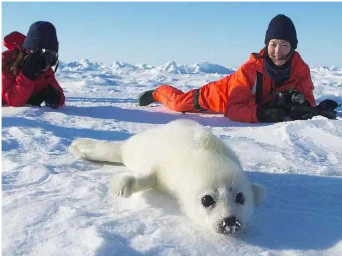
Baby harp and hooded seals are born on the ice around Baby harp and hooded seals are born on the ice each March.

On a bright March day, in the Gulf of St. Lawrence, on the ice fields surrounding the Îles, the wind howls along with the barking harp and hooded seals gathered to give birth to this season's pups. The furry cacophony of life seems to push through the windows of the touring helicopters hovering above.