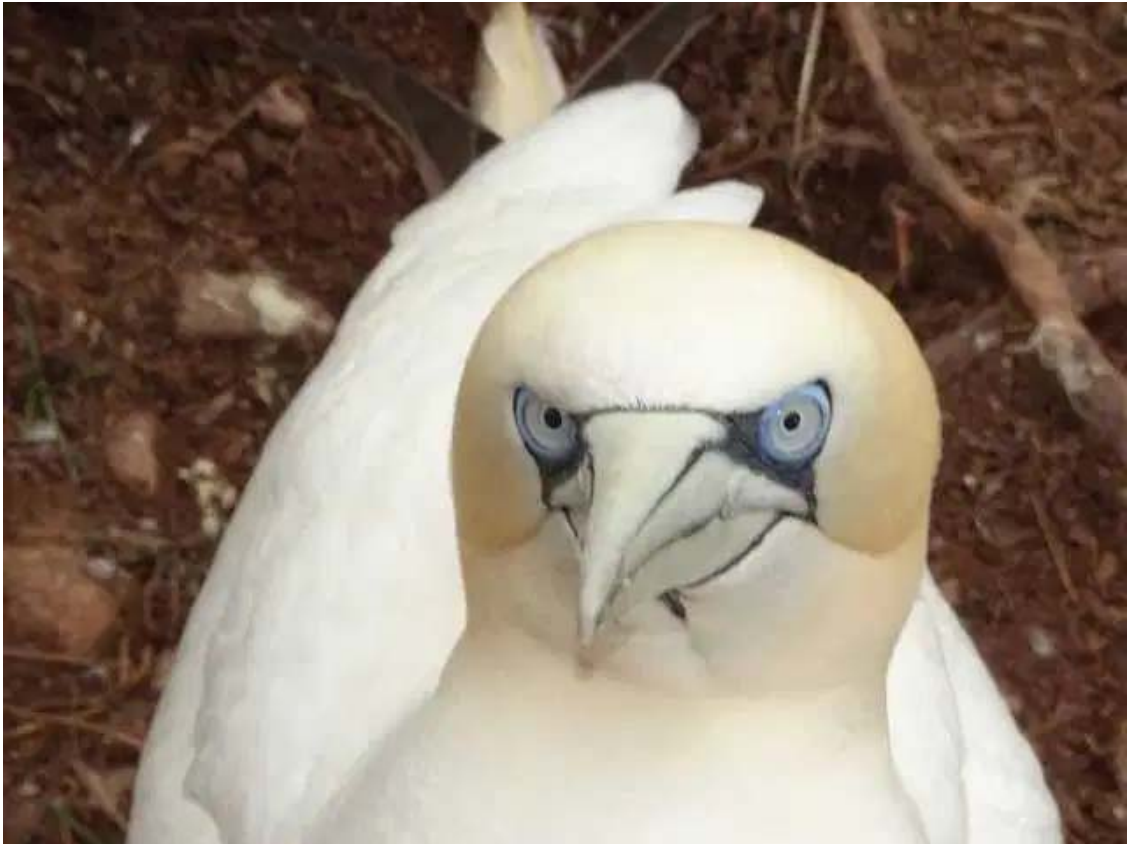
The most easily accessible northern gannet colony in North America is found on Bonaventure Island near Quebec's Percé Rock. LIZ FLEMING

There, on a rocky outcropping, lies North America's most accessible colony of northern gannets – thousands of wild seabirds nesting, raising their young, and fishing the rich waters of the Gulf of St. Lawrence. The eerily blue-eyed adults are covered in sleek white feathers with heads that are a soft burnished caramel – like toasted marshmallows. By contrast, young gannets look wildly disheveled, like split feather pillows, with black beaks pointedly opening in their mother's direction. The colony is in constant motion, with hungry young birds squawking, long-suffering parents delivering beaks-full of food, early fliers practicing lift-offs and tired oldsters patrolling in search of a peaceful perch.