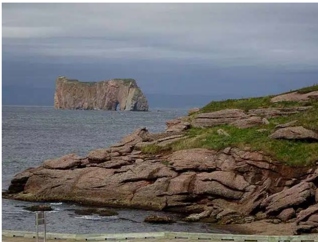
Percé Rock is the most iconic symbol of Maritime Quebec.

People don't think of Quebec as a Maritime province, but with its vast eastern coastline dotted with fishing villages and lighthouses, it certainly feels like one and there's no place where that's more evident than the Gaspésie.