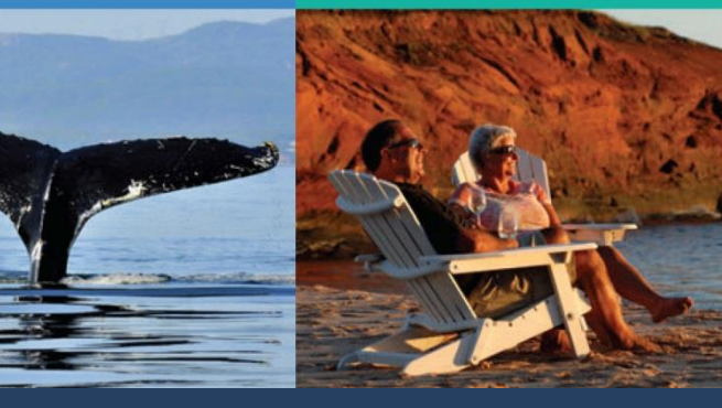
Îles de la Madeleine