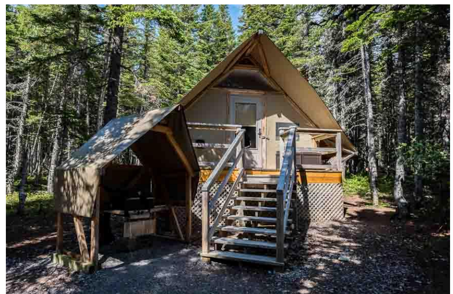
My oTENTik on Quarry Island