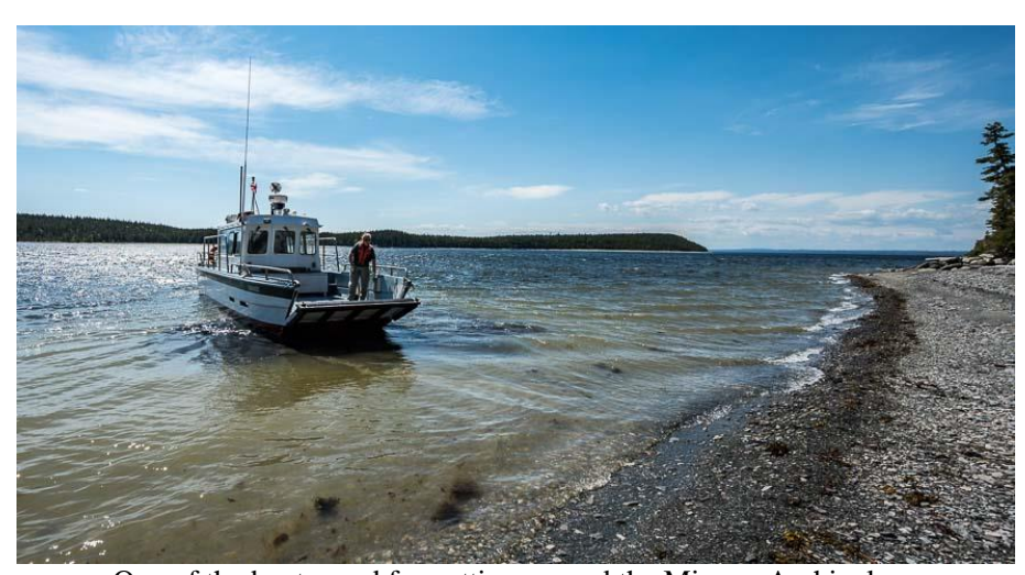
One of the boats used for getting around the Mingan Archipelago