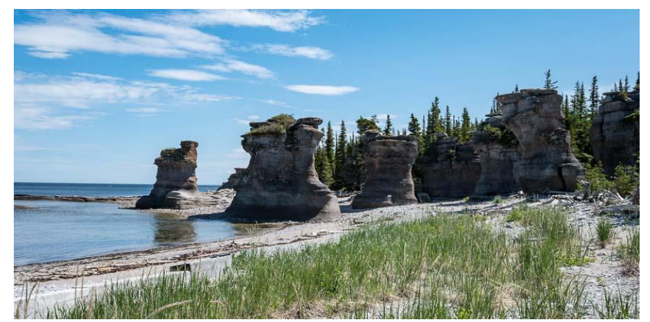
A collection of monoliths on Ile Niapiskau