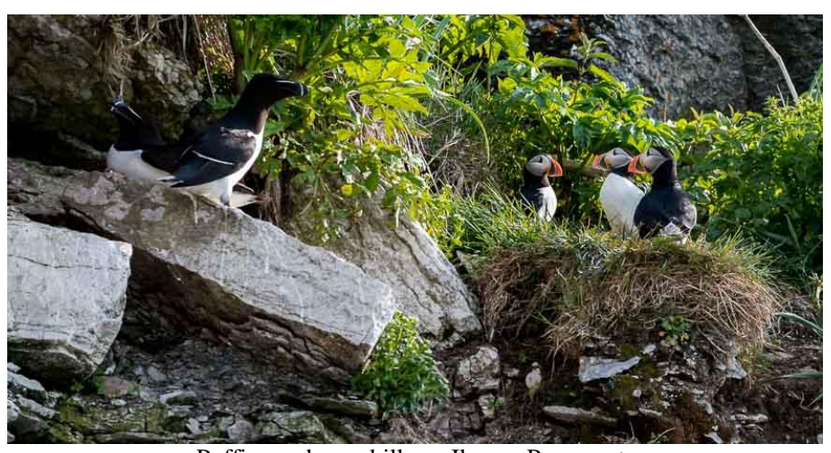
Puffins and razorbills on Ile aux Perroquets

Plan to visit the Mingan in the summer between June and early September. It's a short season with the boats only operating during the summer. August would be a great month from the perspective of fewer bugs. But July is better for puffins.