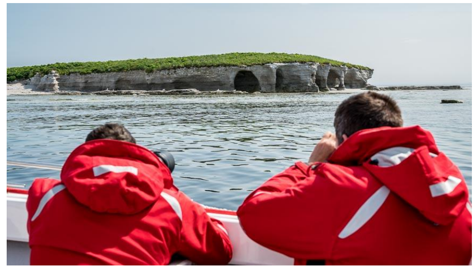
Looking at the caves on Ilot beside Ile Nue de Mingan