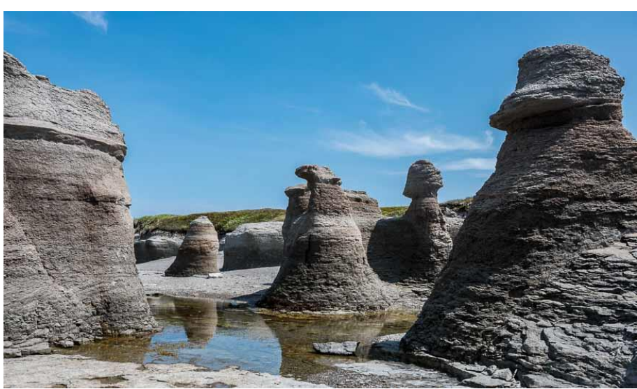
Monoliths on Naked Island