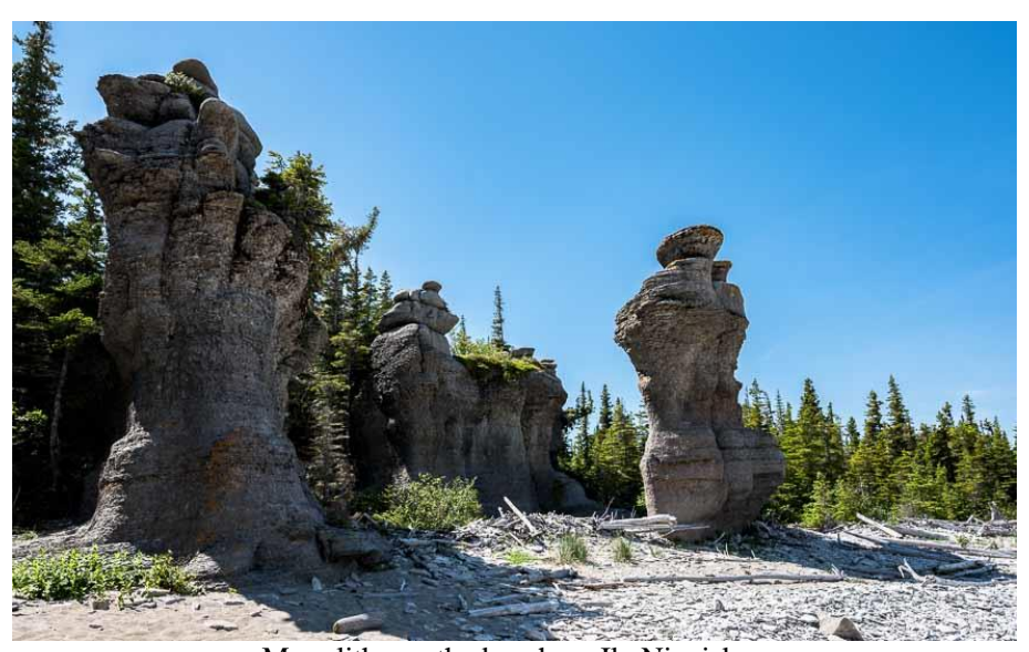
Monoliths on the beach on Ile Niapiskau