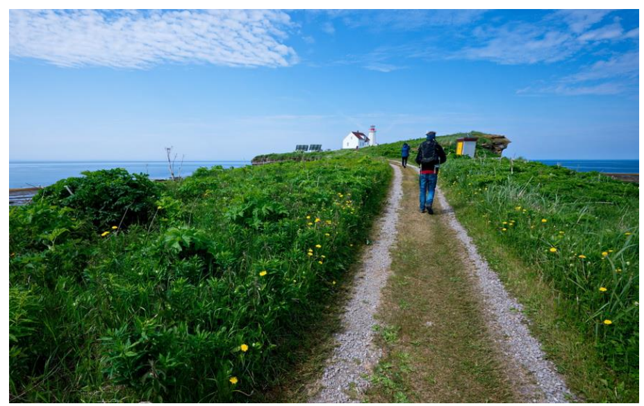
Walking to the Lightkeepers Cottage on Ile aux Perroquets