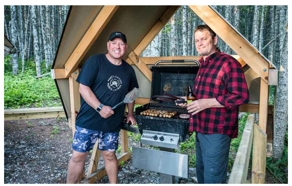
Barbecuing on Quarry Island