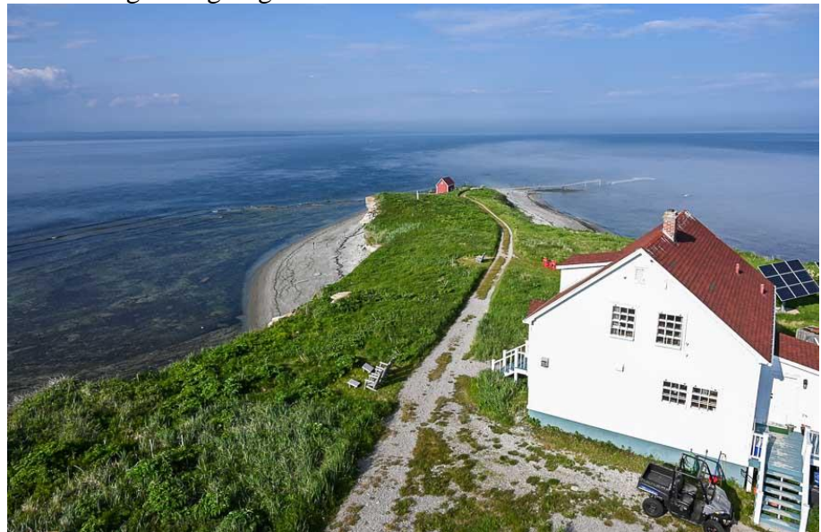
View from the lighthouse of Ile aux Perroquets

The islands are equally famous for their seabird population. The common eider is the most abundant species in the park but the one that people come specifically to see is the Atlantic puffin. The birds arrive sometime in April and are gone by September. An overnight stay in the lightkeeper's cottage on Île aux Perroquets will allow you to watch their comings and goings for hours.