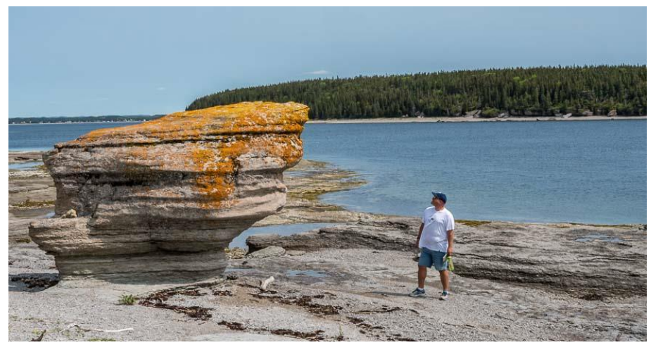
Admiring an erosion monolith in the Mingan Archipelago on Petite Ile au Marteau

The park stretches along the north shore of the Gulf of St. Lawrence in eastern Quebec – near the end of Highway 138. The closest big centre is Sept-Îles, a 2.5 hour drive away while Quebec City is a whopping 860 kilometres away. Two towns that provide boat access to the park include Longue-Pointe-de-Mingan and Havre-Saint-Pierre.