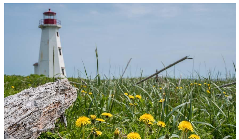
The lighthouse on Petite Ile au Marteau