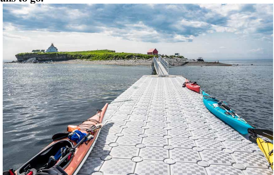
Kayaks on the dock on Ile aux Perroquets

For years the Mingan Archipelago National Park has been on my bucket list. I first heard about the park when I started researching places to include in my book on 100 adventures across Canada back in 2013. Kayaking through an archipelago of over 1000 islands that make up the park sounded like a magical adventure to me. Unfortunately the kayaking company I'd looked at shuttered its doors, and there was no replacement for years. So I nixed any plans to go.