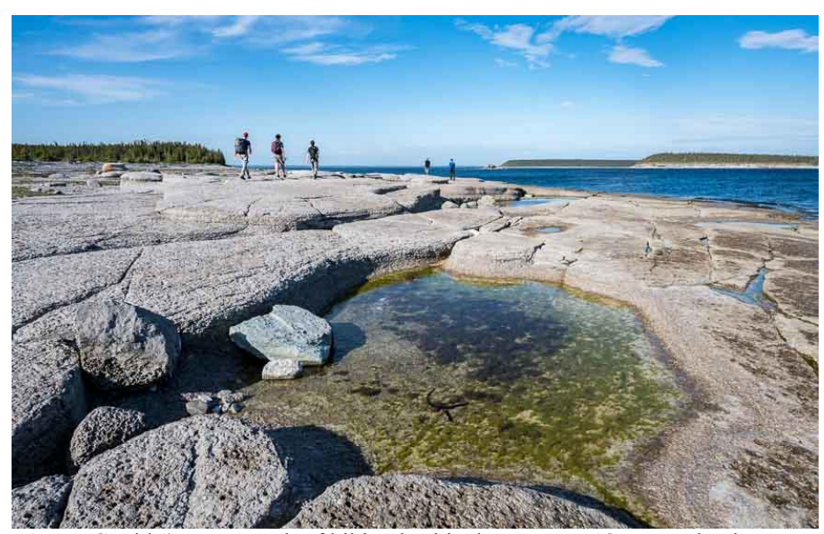
Couldn't get enough of hiking beside the ocean on Quarry Island