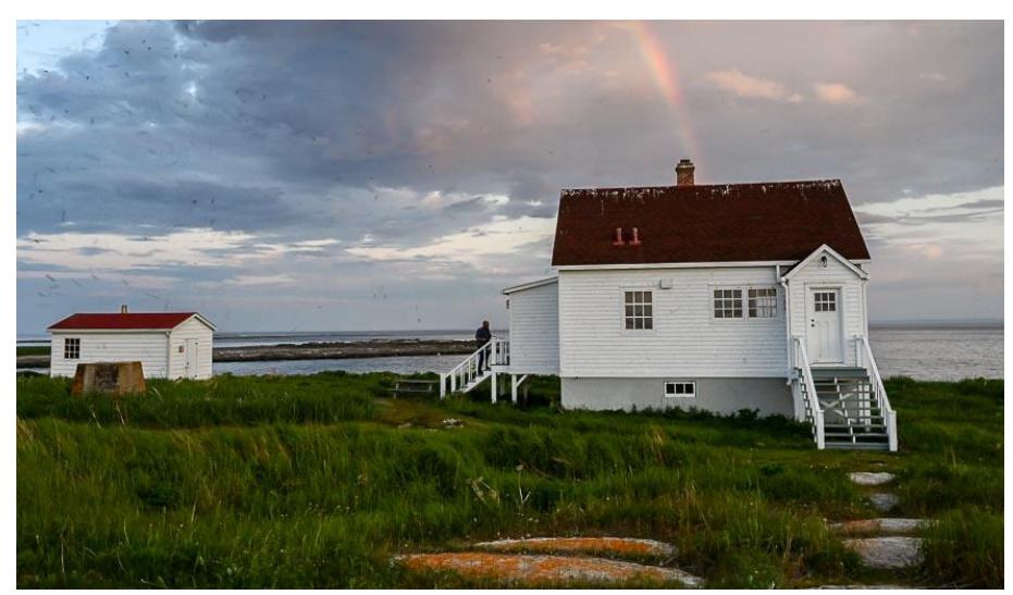
One of the small cottages people can stay in on Ile aux Perroquets