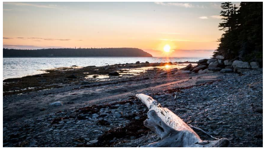
Enjoying the sunset on Quarry Island in the Mingan Archipelago