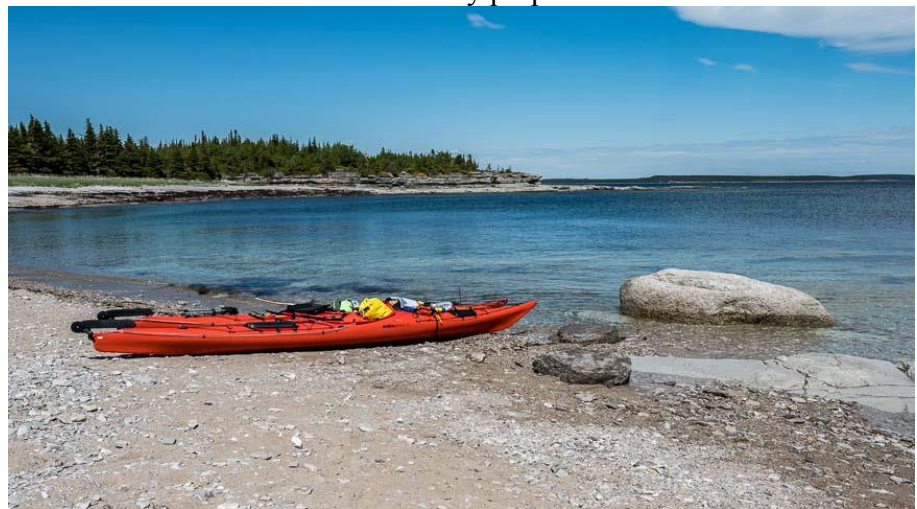
Kayaks are a great way to explore the Mingan Archipelago if you have the skills

Note: If you're doing your own kayaking trip you should be competent at reading charts, understand the currents and the risks of what you're doing. As one Parks Canada person said to me "the weather is either outstanding or horrible. There is no in between." Go very prepared.