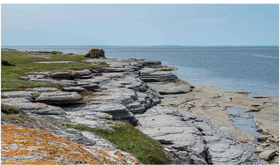
Pancake like rocks on Petite Ile au Marteau

Catch your red chair moment. Walk the trails to the lighthouse. Step back in time as you enter the lightkeeper's cottage. Explore the multitude of tidal pools. And look for numerous common eiders and herring gulls that nest on the island but don't disturb them.