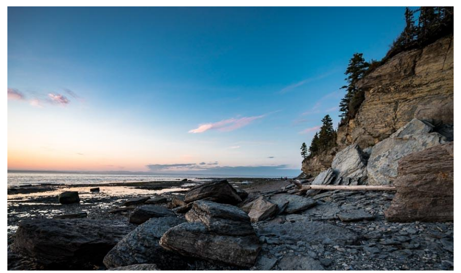
Evening light on Quarry Island