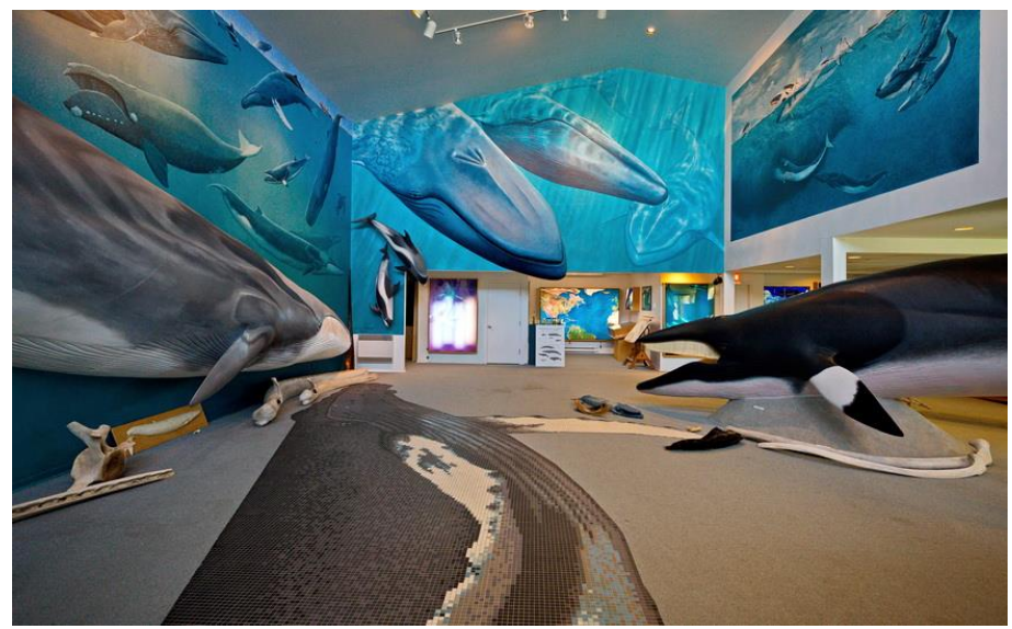
The site of the Mingan Island Cretaceous study